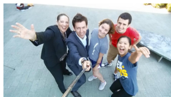
Our Welcome Video